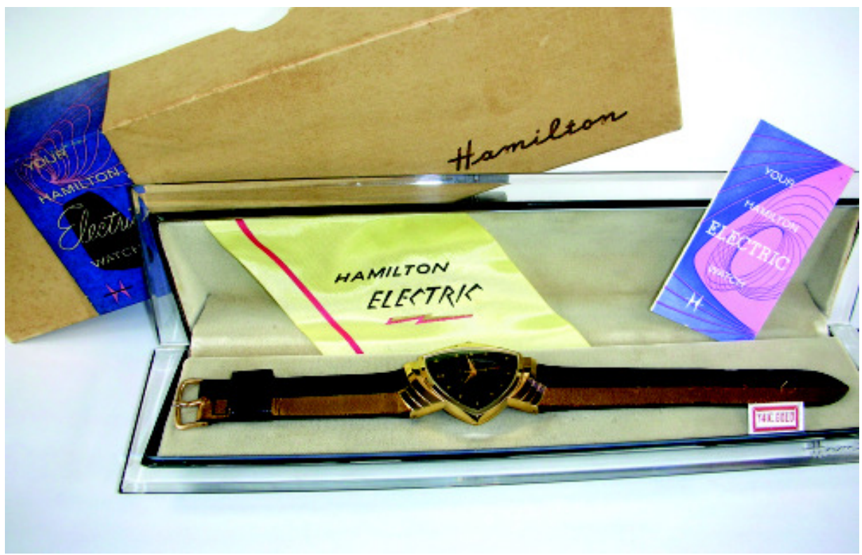
A new "Ventura" from unsold jeweler stock. This was one of the very earliest "Venturas," with two-tone strap and the first style of packaging, with a paper label on the outside of the box and a ribbon added to the inside.