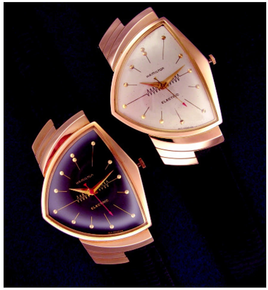
18K rose gold "Venturas" made for export. These are among the rarest and most desirable of all Hamiltons, and arguably the most beautiful as well.

Watches which were exported from the U.S. were made of 18K gold because 14K gold did not meet foreign standards of purity for gold jewelry. The 18K yellow gold "Ventura" was sold in the European market, and an 18K rose gold version was made for export to South America. Hamilton's export sales were never large and consequently 18K "Venturas" are very rare. Typically these export